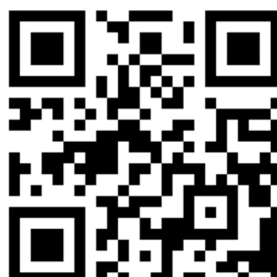
CK1303LED - SLIDING

It is important to maintain the cleanliness of the condenser and/or evaporator on your product. Improve efficiency and avoid expensive breakdowns by using our Condenser Cleaner. Keep your product working better for longer.